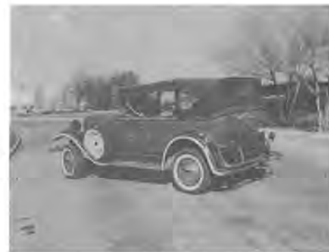
OUR COLOR COVER PHOTOGRAPH

Coming next month- photos of the 1st National Meet held in Australia last Easter. Also, the first year progress report on the fund drive for the Century Center in South Bend. Remember that donations are tax deductible, so it's not too early to start figuring to see if it would be to your advantage to contribute before December 31st.