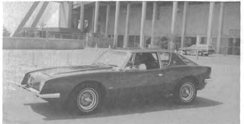
SPECIAL DIVISION Dallas Neeley, Tennessee, 1963 Avanti