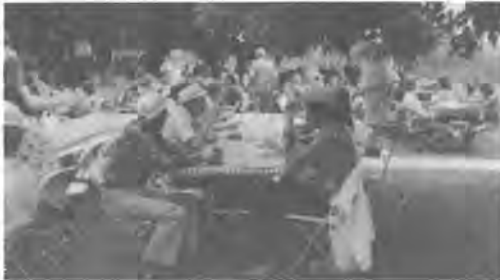
The weather was perfect for the outdoor Bar-B-Q at the Pate Ranch.

officers and board members in the morning, and then at noon treated all of us to Texas Bar-B-Q under the trees. They served hundreds of people efficiently with delicious Texas food.