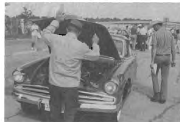
The judges had a big job Wednesday. (If you look closely you can see "Houston SDC" and a white avanti outlined on the back of his shirt.)