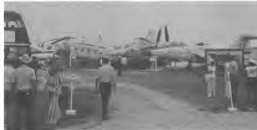
Besides cars, the Pate Ranch has a large collection of military airplanes.

people were attracted to Studebakers in the first place because all the SDCers you meet are people you would like to know better. I have attended several meets without a car to show, and I can assure you that you will still have a great time meeting other SDCers and looking at their Studebakers.