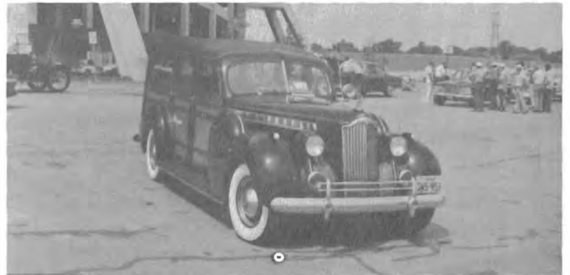
PACKARD DIVISION Jim Hollingsworth, Texas, 1940 160 Station Wagon