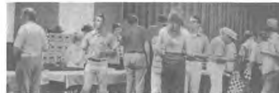
Scenes in the hospitality room. Those boxes at the rear are cases of free drinks waiting to be served.

The meet committees had taken care of every detail, even the weather was sunny every day, perfect for taking pictures and keeping the chrome shiny. It was hot out during the swap meet and concours, but that is to be expected during a July meet - and certainly preferable to rain. Events were centered around the headquarters motel with the Dr. Pepper-Shiner counter being the most popular location and the Standard Surplus room a close second. Newman & Altman had trucked down a large supply of