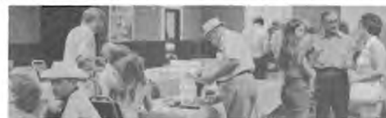
The Literature Swap was spread out over a large ballroom. It was close to the hospitality area which did a large business again Tuesday.

Early risers Tuesday got the Swap Meet going in a nearby drive-in theater lot. This was another innovation, the swap meet the day before the concours. This proved very convenient for anyone needing a few parts to finish his car before the judging. At the same time, but not starting as early [at least at our booth], the Literature Swap spread out tables of Studebaker literature in the ball room near the hospitality counter. This resulted in a great benefit to the buyers and browsers. When they became a little warm and tired at the outdoor Swap, they could come inside in air-conditioned comfort to sample the free beverages and sit down at the literature Swap to look through some parts books. Then, refreshed and armed with