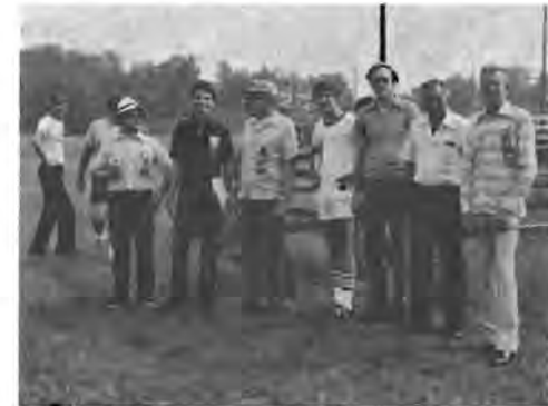
Judges ready to go at 9 AM.