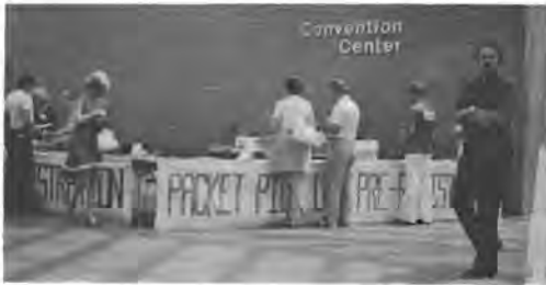
"HomeComing Week '78"

The 14th Annual International Meet of the Studebaker Drivers Club brought together what was probably the largest group of Studebakers in South Bend since the last 1966 models were shipped out. Registrations showed 580 SDC families brought one or more cars and trucks for most of a week last July to participate in a full schedule of meetings and activities - fitted in around a lot of Stude talk and parking lot admiring at motels all over town.