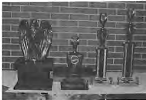
The Golden Hawk, the Minnie Barnes Award, and two of the trophies ready to be awarded.